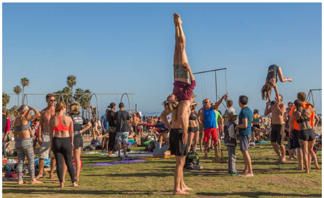
Sunday Gymnastics 1/250 s, F10, ISO 100, 47 mm. Muscle Beach

I never take photos of children or people in compromising situations. I am respectful of the people and places I take photos of. I try to just get the quick grab image and move on. I have never had a bad experience while taking street photos and I have met some really nice people. If people do ask me about an image, I show them and if they give me their email, I send them a copy of the image after it has been processed.