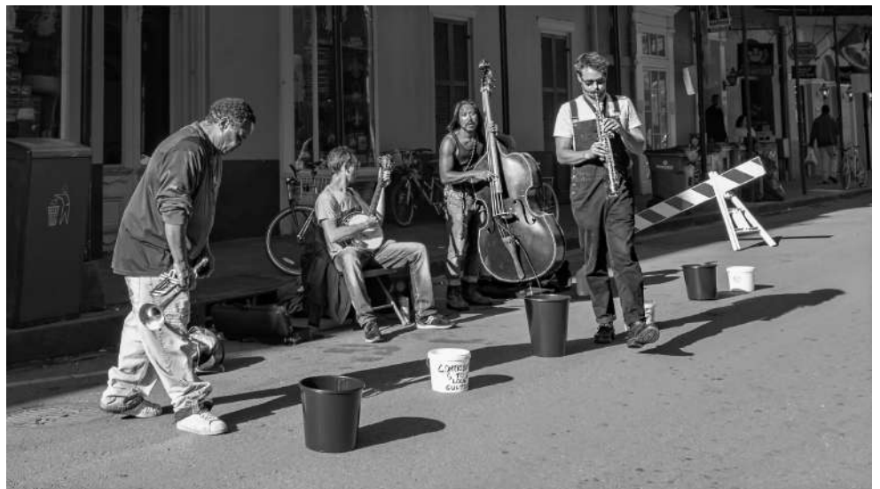
In the Groove. 1/100 s, F7.1, ISO 100, 24 mm. New Orleans

I take a few clicks in different places to get a feel for the light and how things will look in camera. I am not afraid to wait for the image to come to me. Enjoy a coffee at a well-chosen spot and you will be amazed at what images you can capture.