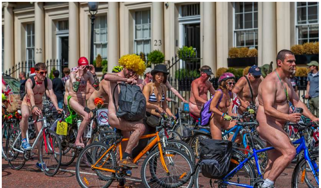
Raw Fun 1/200 s, F6.3, ISO 100, 82 mm London

Finally, get out and try it. Street photography is fun and rewarding but I did take a while to get comfortable doing it. Practice makes you comfortable. No matter where I am, I just pretend I am a tourist. Dark unremarkable clothing, open body language and a smile always works well.