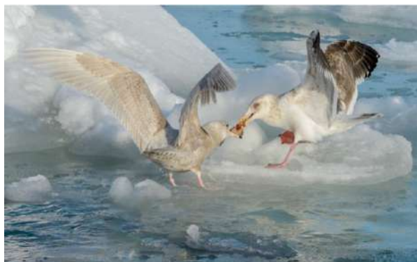
Delete and Fill Selection